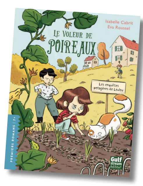
Release Date: August 2020